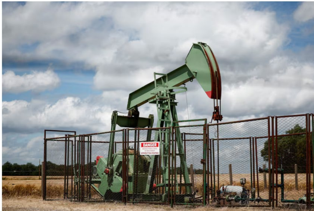
File Photo: A pumpjack operates at the Vermillon Energy site in Triguères, France, June 14, 2024. REUTERS/Benoit Tessier/ File Photo