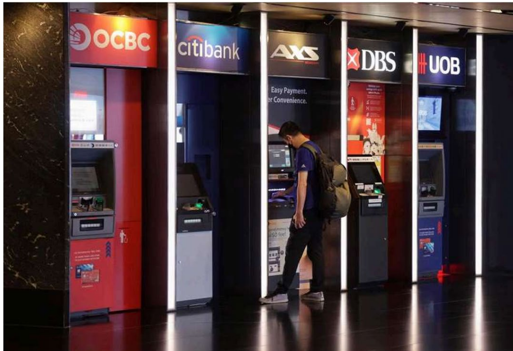
MAS said firms in Singapore, including SMEs, retained access to credit even as lending conditions moderately tightened in recent quarters.

Singapore companies, banks remain financially resilient even as borrowing costs rise: MAS